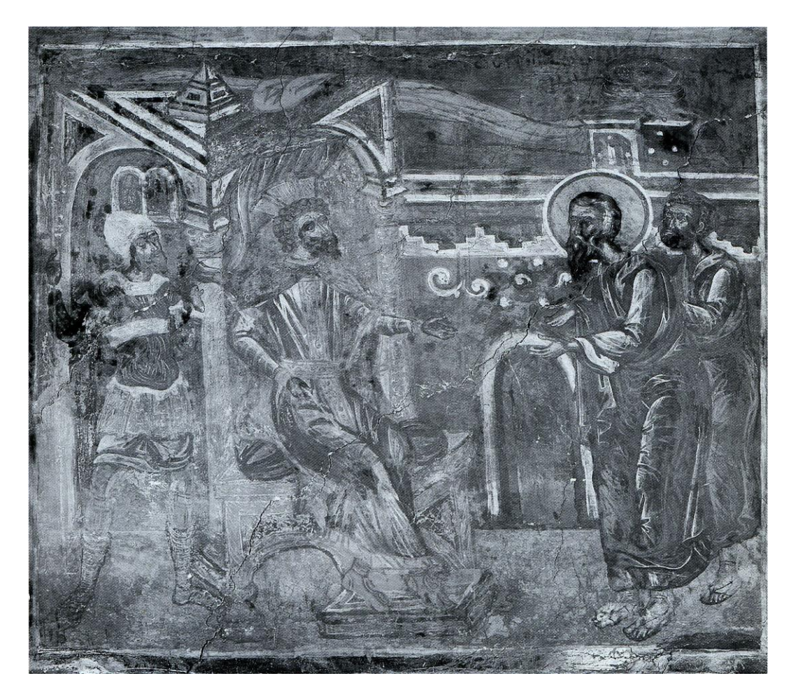
11. The Request of Joseph of Arimathea , Gyromeri monastery, Thesprotia, Greece, 16<sup>th</sup> century.

The scene appeared already in the Paleologian period<sup>57</sup> but in art from the 15^{\text{th}} century it existed only in Greek and Romanian monuments. In this particular case there is a link between the monastery in Epirus and the trans-Danubian principalities: a decree by Patriarch Metrophanes III from 1568 mentioned as donator Mr. Axiotis, who was born in Epirus and was the first agas of Ungro-Wallachia between 10.12.1567 and 23.05.1568<sup>58</sup>. It is based on his initiative that in the same year the prince of Wallachia Petru the Younger granted a yearly support to the Gyromeri Monastery in the amount of 1000 aspras<sup>59</sup>. In the 17<sup>th</sup> century the interest of Romanian rulers in this Greek monastery increased<sup>60</sup>. It is unclear, however, how the donations became borrowed ideas for iconographic themes and what was the direction of influence: whether art in Greek lands influenced the Romanian one, or vice versa – old iconographic schemes remained on the periphery of the former Slavic and Byzantine community and then transformed returned back to the lands with a Greek-speaking population. Another issue is the language of the inscriptions in these scenes, since if we