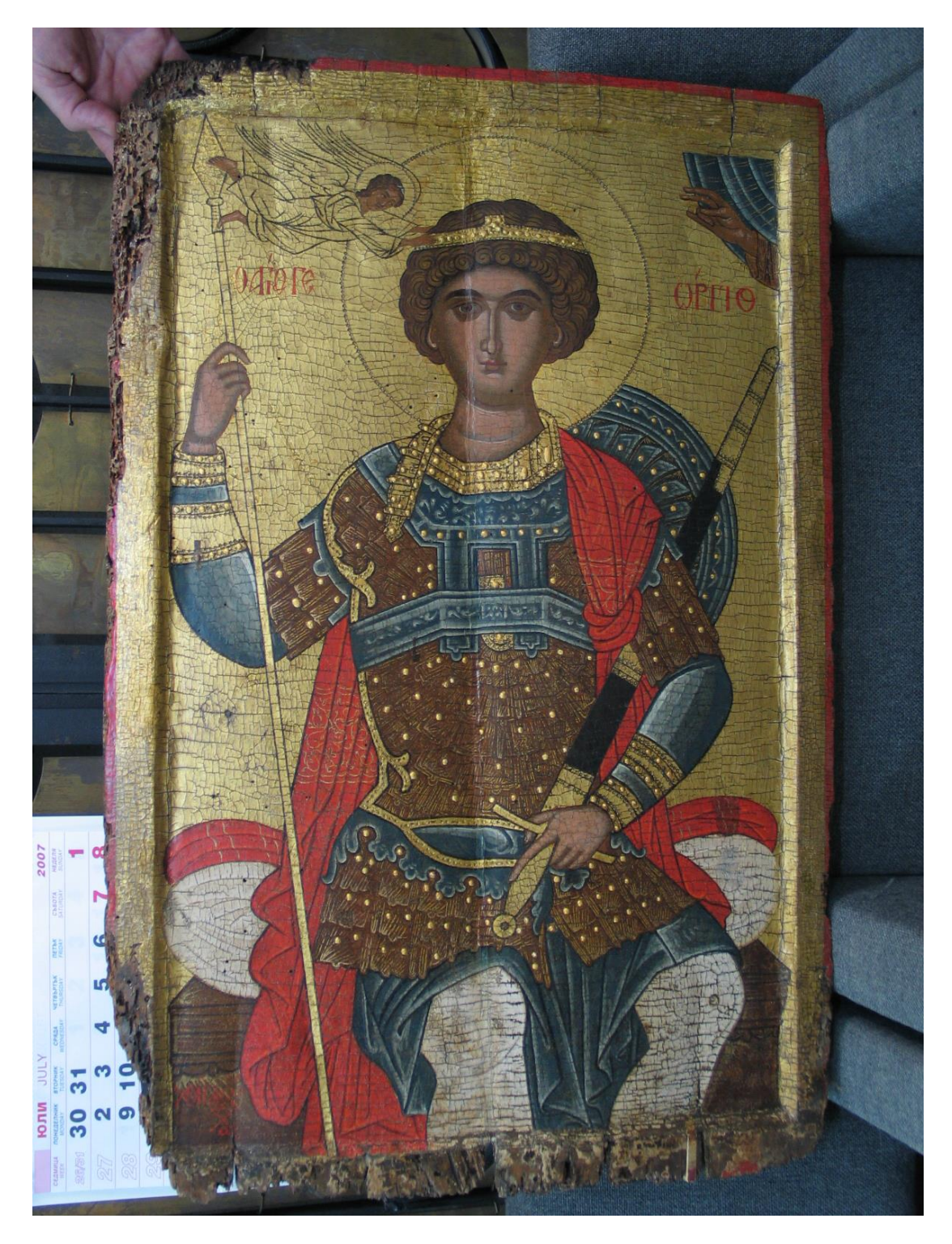
6. St. George , by hieromonk Pachomios, National Art Gallery, Sofia, 16<sup>th</sup> century.