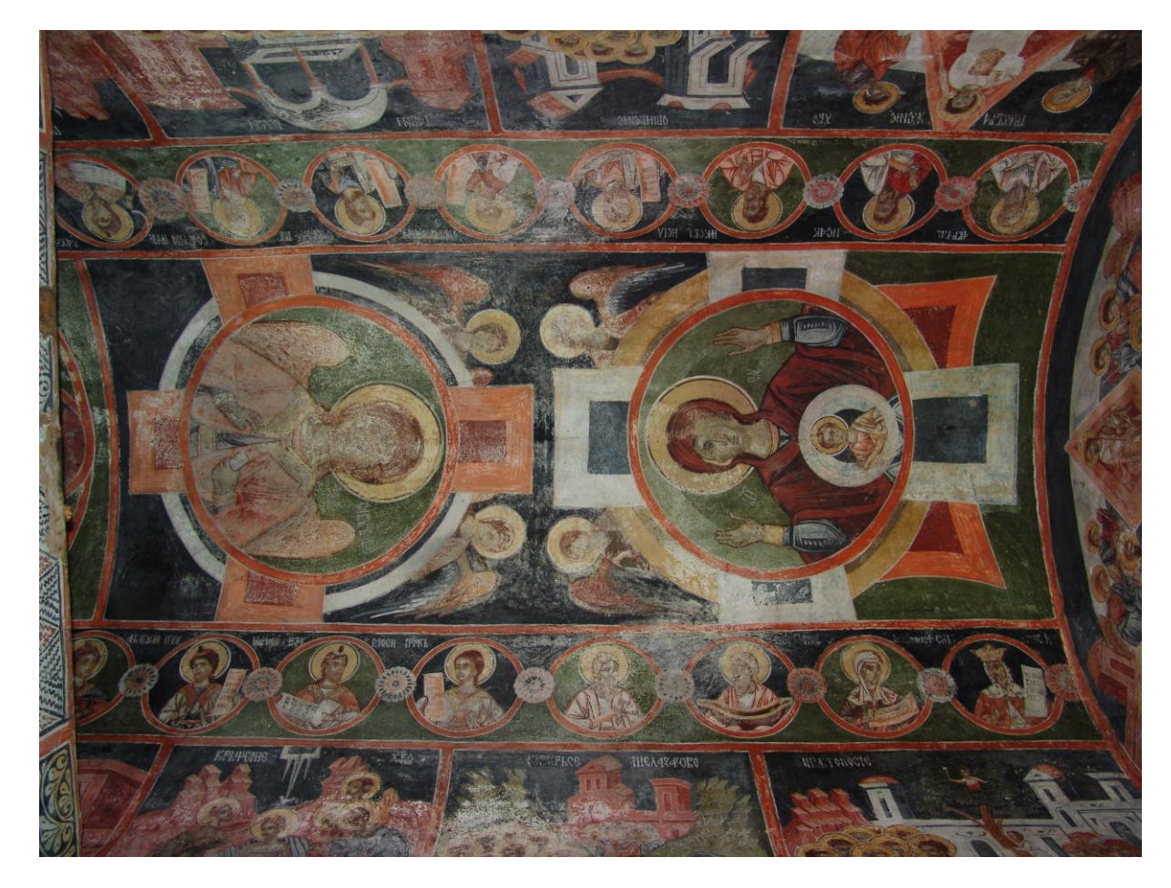
7. Roof mural decoration of the Sts Theodor Stratelates and Theodor Teron' church in Dobarsko village, Bulgaria, 1614.

Another Greek signature is that of Constantine<sup>34</sup>, who made icons in Nessebar and was certainly Greek as well. On the basis of such scanty data, we can tentatively deduce that, a century after the Ottoman conquest, the highest-ranking clergy in Bulgarian territories had been replaced by Greeks, some of the monks were of Greek origin as well, or began to write in Greek, and that happened mostly in places with compact Greek populations like Plovdiv and the Black Sea coast. Nevertheless, the workshop of Pimen Zographski became active in Sofia and its vicinity, producing high-quality wall-paintings for the monastery of St John of Rila in Kurilo in 1596; for the church of St Theodor Teron and St Theodor Stratelates in the village of Dobarsko in 1614 ( ill. 7 ); and for the monastery of the village of Seslavtsi in 1615-1616; at the beginning of the following century, it produced works within the present borders of FYROM and in the Zographou monastery on M. Athos. Frescoes from 16<sup>th</sup> to 17<sup>th</sup> century survived as well in the Ilientsi Monastery, near Sofia ( ill. 8 ).