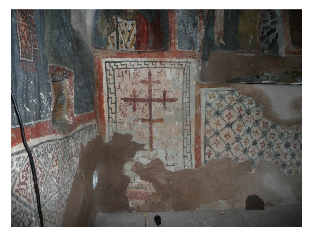
5. Detail of a mural decoration with cryptograms from the church of St. Demetrios at Boboshevo village, Bulgaria, 15<sup>th</sup> century.

artists are known in present-day Bulgaria, signed in Bulgarian in the monastery of St Demetrios in Boboshevo ( ill. 5 ): Neophit and his sons Dimitar and Bogdan<sup>27</sup>.