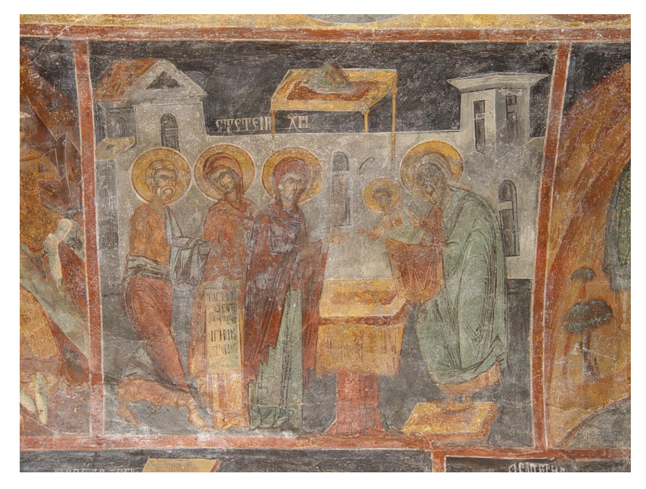
8. The Presentation of Christ in the Temple, Ilientsi, near Sofia, 16-17<sup>th</sup> century.

From the seventeenth century, data are available for more or less the same number of artists who signed their names. There are eight of them. The following are certainly Greek: hieromonk Kesarios (ill. 9) and Jakovos Daronas<sup>35</sup>, who painted icons for the Greeks in Nessebar.