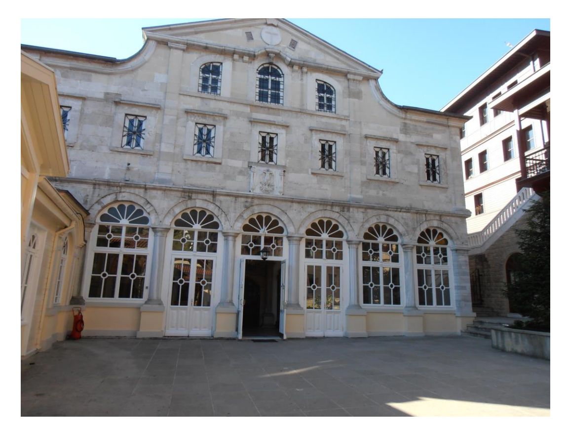
10. View to the entrance of the main church of the Ecumenical Patriarchate today, Istanbul.

liturgy"<sup>47</sup>. Furthermore, from that period onwards "Greek practically replaced Church Slavonic and became the official language of the Church and rulers" <sup>48</sup>. These are parallel processes observed also in Bulgarian lands – in the 17<sup>th</sup> century Bulgarian and Greek inscriptions in churches were equal in terms of quantity, while during the next century the ones in Greek predominated, when in Moldavia and Wallachia the so-called "Phanariot period" began<sup>49</sup>. These tendencies were inspired by the Constantinople Patriarchate ( ill. 10 ) and were aimed mostly at weakening the Bulgarian element in local churches within the Ottoman Empire, and not so much at limiting the Russian influence, which is related to a significant political and financial support from the Ecumenical Throne.